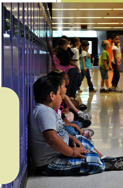
Kindergarteners had a great first day!

Our doors open at 8:00 AM and our school day lasts from 8:35 to 3:20, except for Wednesdays when our hours are 8:25 to 1:50.