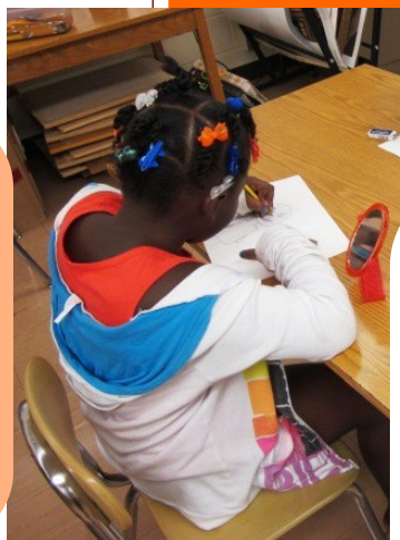
Every student began the year by making a self-portrait in art class this year (above)